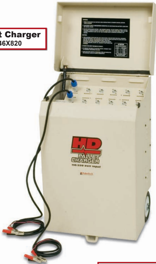
HD Pallet Charger PUL 746X820