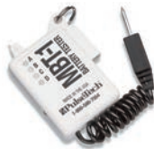
(10) MBT-1 Mini Battery Testers PUL 741X800