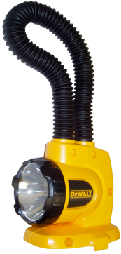
(2) Flexible Neck Light