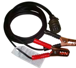
Clamp-On Terminal Adapter