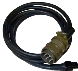
12 Volt DC w/ 10' Pig Tail