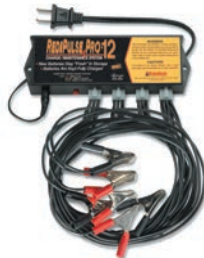
RediPulse Pro-12 Multiple Battery Charge System PUL 746X912