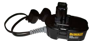
(12) 18V XR+ Battery Packs 2.4 AMP Hour

* All prices subject to change based upon addition of new components. Components may be substituted due to availability. Items may not be shown individual.