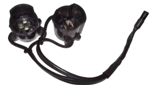
(2) Pig Tail

* All prices subject to change based upon addition of new components. Components may be substituted due to availability. Items may not be shown individual.