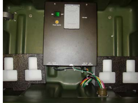
Customizable Electronics for Many Voltage or Current Requirements.