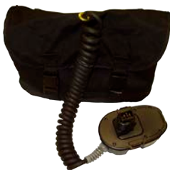
Wearable High Capacity Battery Pack