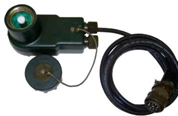
24 Volt DC/Nato Slave Plug w/ 10' Pig Tail