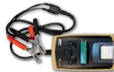
MDX-490PT Battery Analyzer PUL 741X491