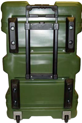
All Weatherproof Weight 130 lbs. Dimensions - 22"H x 32"W x 20"D