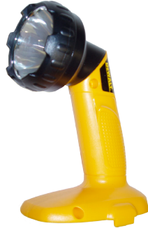
(2) Pivoting Spot Light