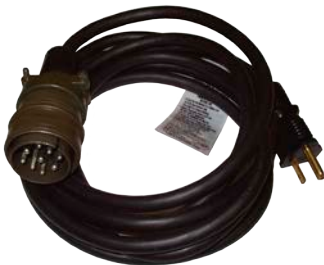
110 Volt AC w/ 10' Pig Tail