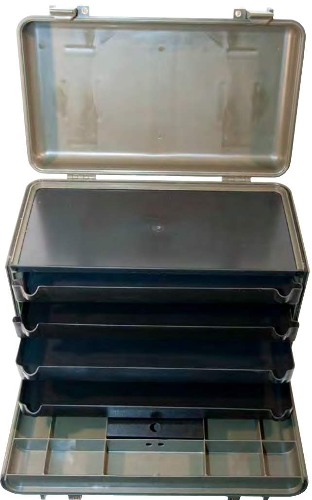
Inside front door compartment locks to secure wallets, watches, and personal items while working from tool box.

CAD design and tooling by CNC routers provide high quality foam inserts for custom configurations of tools. Heavy duty 4 lb. high contrast dual-layered foam provides instant inventory features with excellent tool protection.