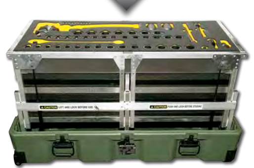
8" Hydraulic Extension reveals customizable tool drawers

Removable lid exposes customizable heavy duty, Rapid Inventory Foam